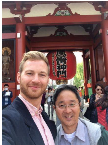
@ a well-known tourist spot "Kaminari (Thunder) Gate" Asakusa Senso-Ji Temple