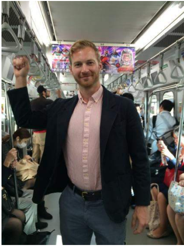
A cowboy on a Tokyo commuter train